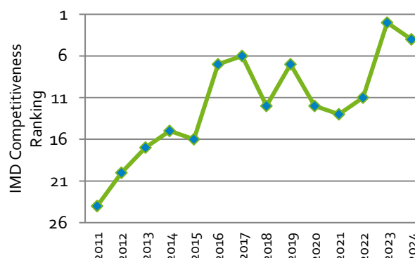
Figure 1: Ireland's IMD Competitiveness Ranking 2011-2024

Ireland's competitiveness ranking fell two positions from 2 nd place to 4 th place in the latest assessment. Ireland continues to rank among the most competitive economies globally, with this year's ranking the second year Ireland has ranked in the Top 5 economies. Ireland has consistently been placed in the top 20 most competitive economies globally since 2012 (Figure 1).